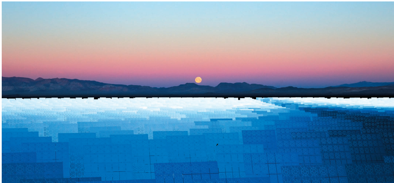
Decarbonizing the world economy will require renewable energy generation from vast solar farms, such as this one in Nevada.